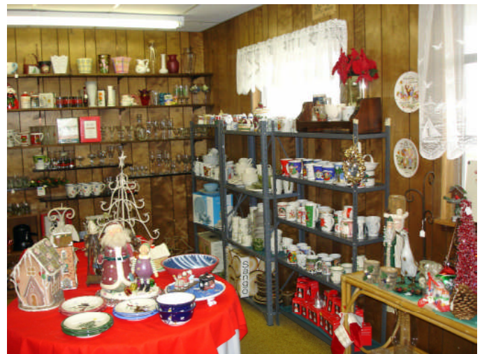
Christmas at The Lamp Shoppe

Silent Auction includes Lladro figurines